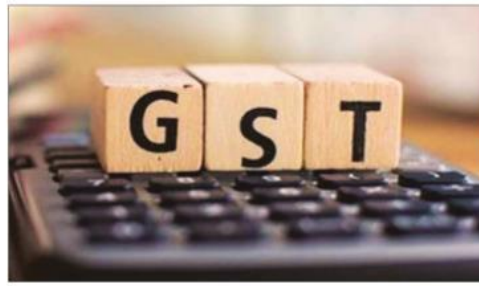
State to receive ₹1,689 crore this fiscal in compensation dues

With this, all 28 states and three UTs are now on board for the plan. Jharkhand was among the 10 states initially opposed to the borrowing plan, but since then other states had come on board. They demanded that full compensation of ₹1.82 lakh crore should be given instead of a portion (₹1.1 lakh crore) that was purely due to GST implementation issue without factoring in the impact of the pandemic. "All the 28 States and three Union Territories with legislature have decided to go for Option-1 to meet the revenue shortfall arising out of the GST implementation," the government said after Jharkhand communicated its decision. The borrowing scheme, under a special window, was